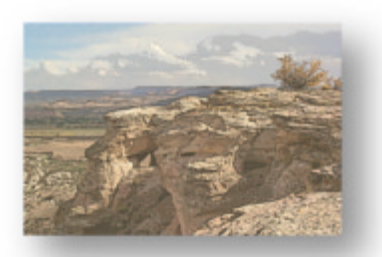
Click here to return to Volume Title Page